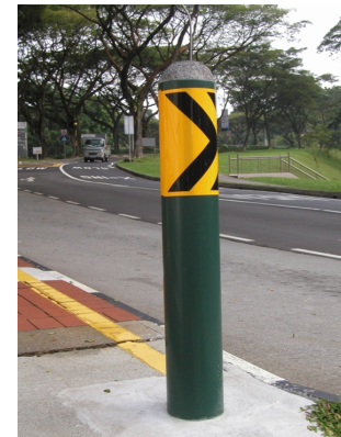
Figure 2: Concrete-filled, round HSS, embedded bollard